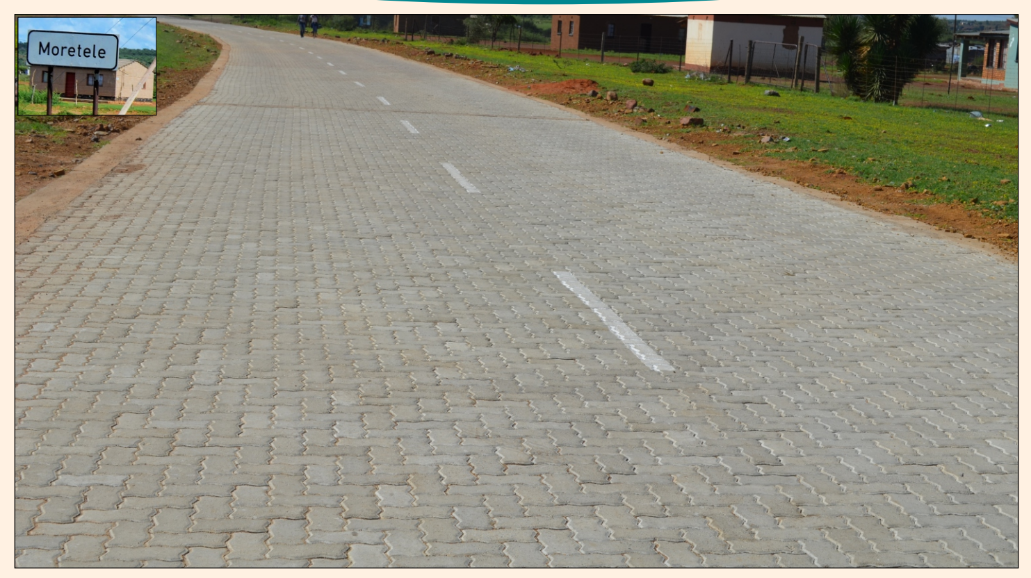
Two of the road projects, 1.8 km each, done as part of the contractor development programme are access roads in Moretele and Khaukwe villages in Greater Taung Local Municipality. Six emerging contractors benefitted from these projects completing 600m each.