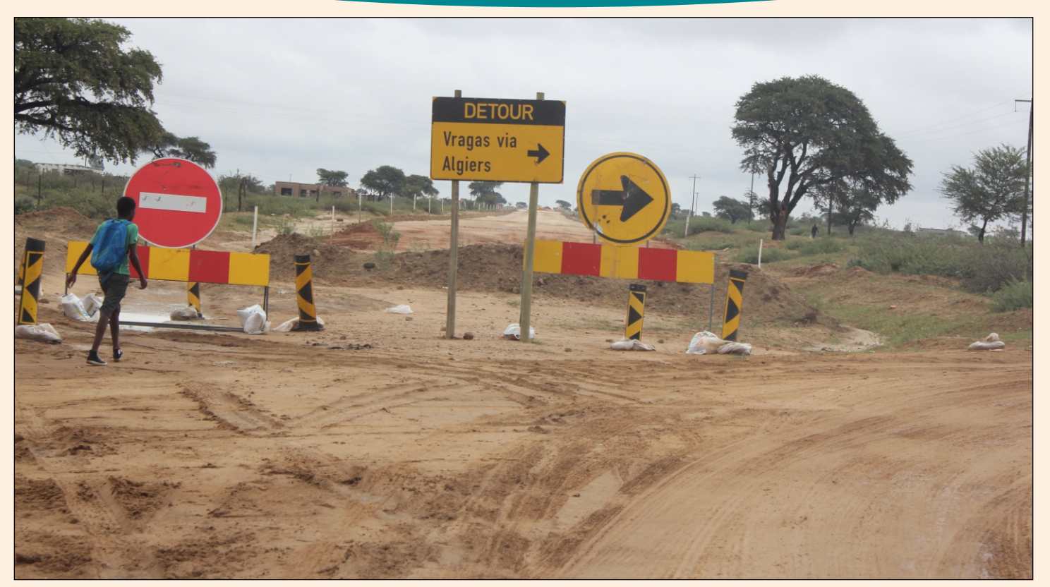
Upgrading of 57km road from Ganyesa to Vragras to Madinonyane (D327): Progress is currently at 25 percent. The resumption of the project was delayed by lengthy negotiations of the new contract terms.