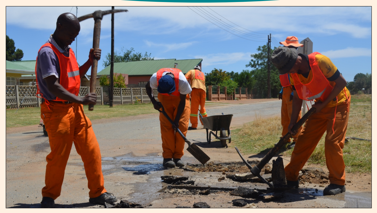
Routine maintenance especially in the form of pothole plugging on roads often pose a challenge but plans are in place to deal with the challenges adequately to make most pothole-infested roads like the one below trafficable