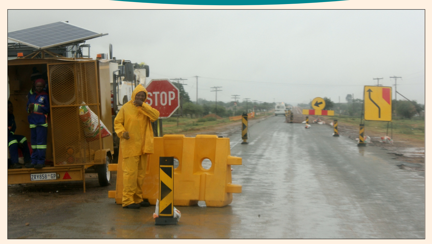
Construction work in progress on the road from Setlopo to Meetmekaar (D413): This project is at 85 percent physical progress. An additional 5km is being considered to link to Springbokpan.