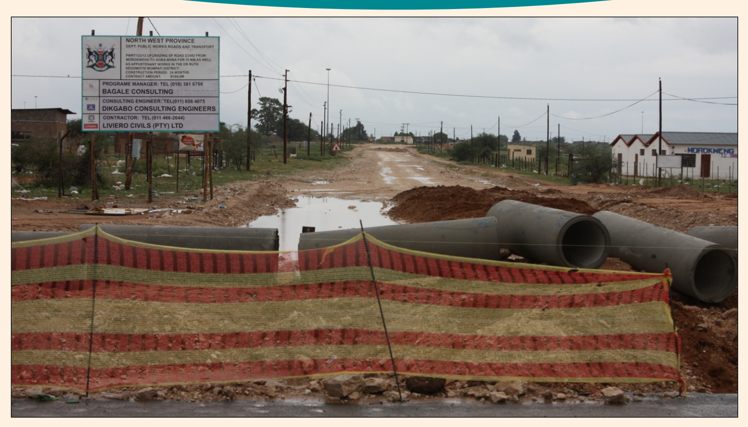
Upgrading of Road D3492 from Morokweng to Bonabona: This project is at 51% physical progress. It is targeted to be completed in February 2017.