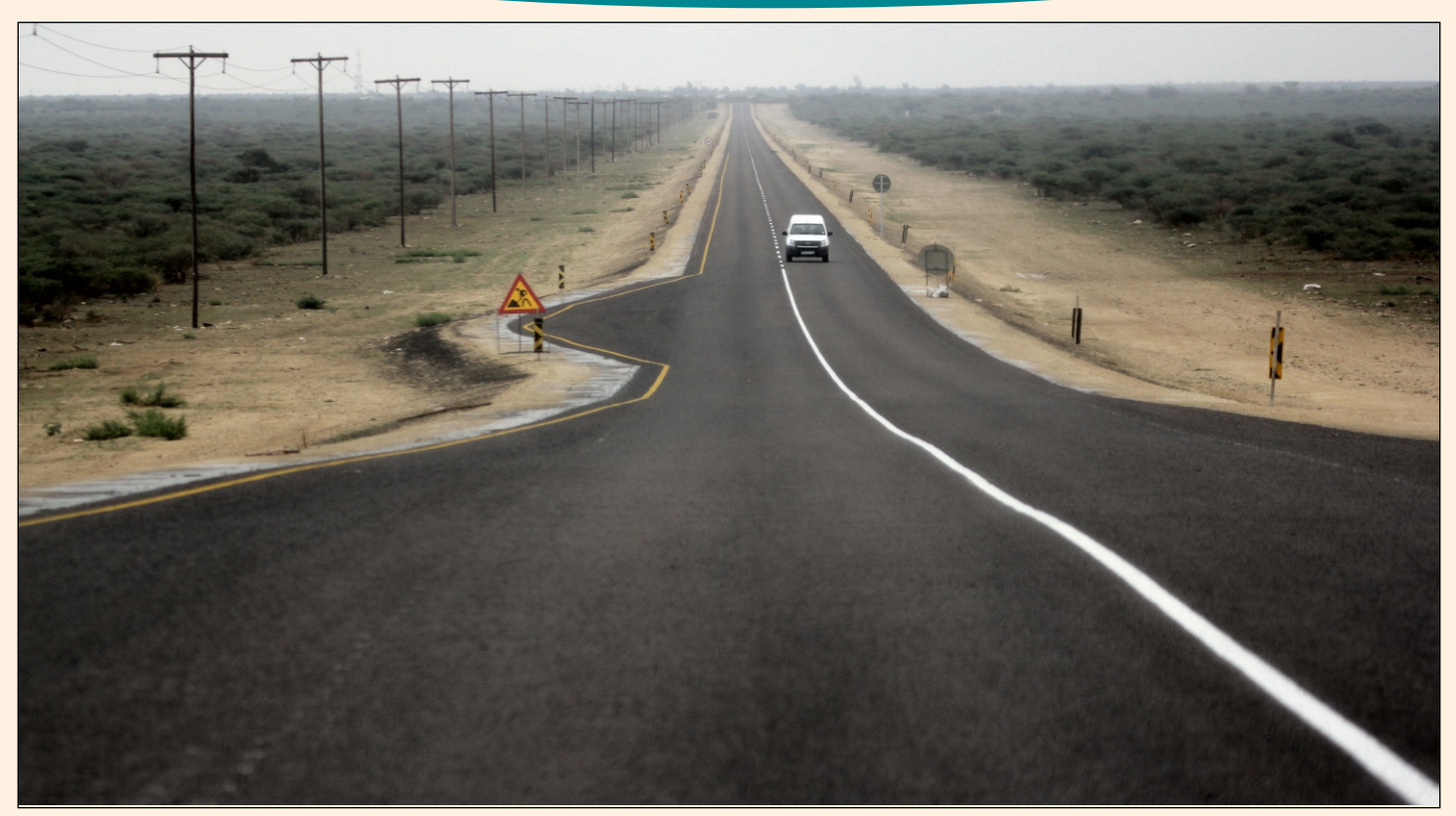
This is a completed road, one of the Capex projects Kagisano Molopo District, Dr Ruth Segomotsi Mompati District. It is from Morokweng to Vostershoop.