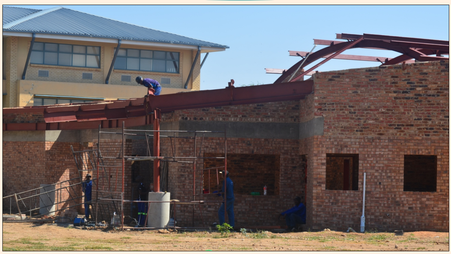
Remarkable progress has been made to the construction of Health and Wellness Centre in the precinct of the department at the cost of R12m. Below: The new Head Office Building is also getting a face-lift of more than R60m.