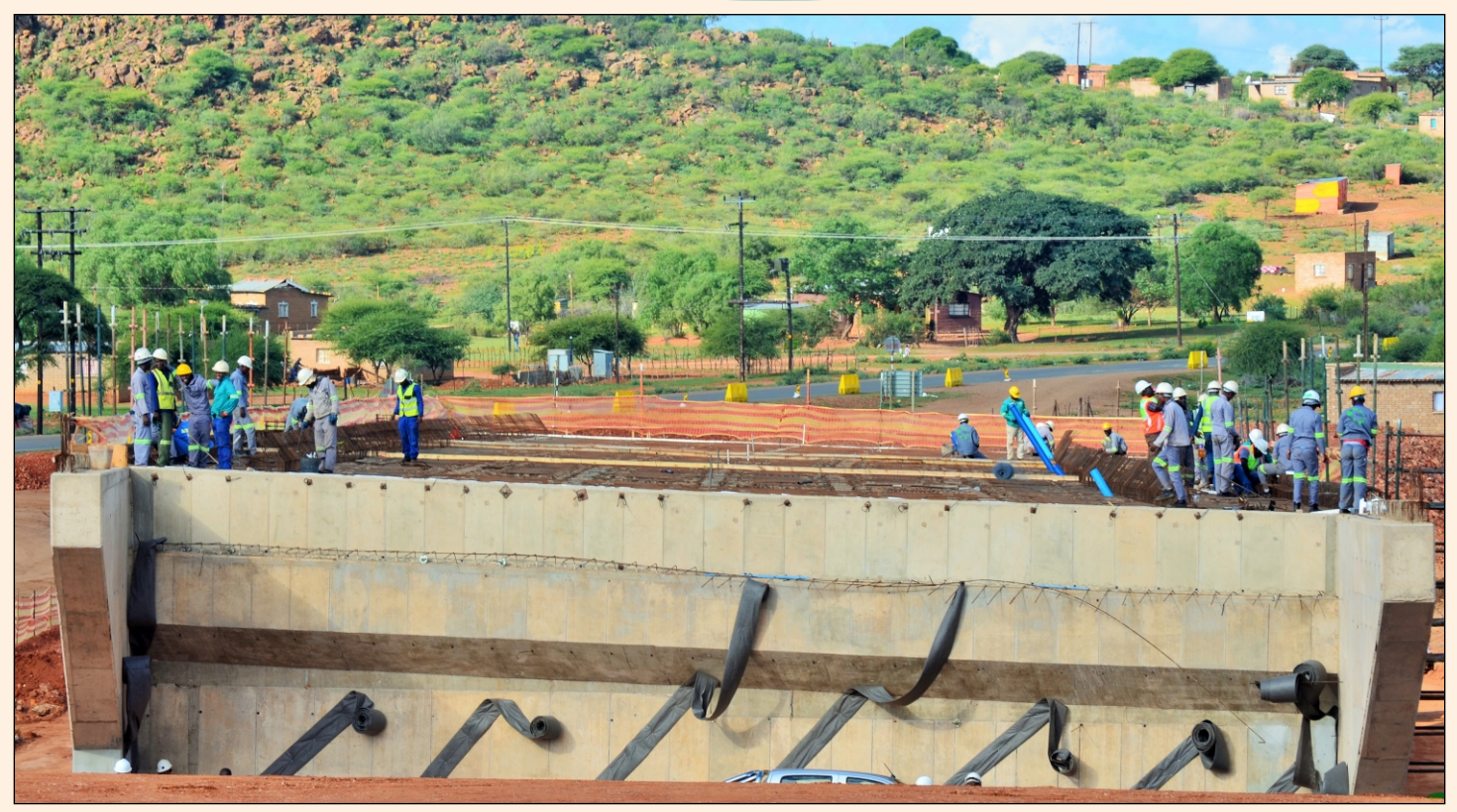
The new dual-carriage bridge project near completion at Kolong village in Taung, on the P25/1 road, will replace the old single carriage bridge. The R81m project constructed by Makali Plant and Construction is on the road that connects Taung and Schweizer-Reneke. The bridge has a guaranteed a life span of 120 years. About five family house-holds in the background are currently a subject matter the provincial government is seized with with regards to relocations in order enable to completion of the road project.