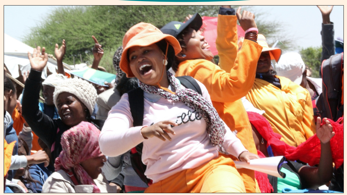
The Department of Public Works and Roads, as mandated, continues to lead, coordinate and monitor the Expanded Public Works Programme (EPWP) as implemented by all public bodies within the Province, inclusive of National Departments with a provincial presence.